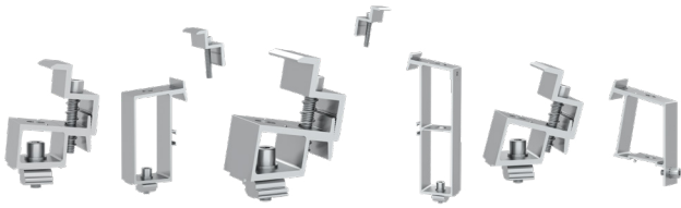
FL-COMT/Z/G & RL-COMT/Z/G Leg Assembly

Highly pre-assembled Legs enable easy and fast installation. Manufactured from aluminum offer excellent corrosion resistance.