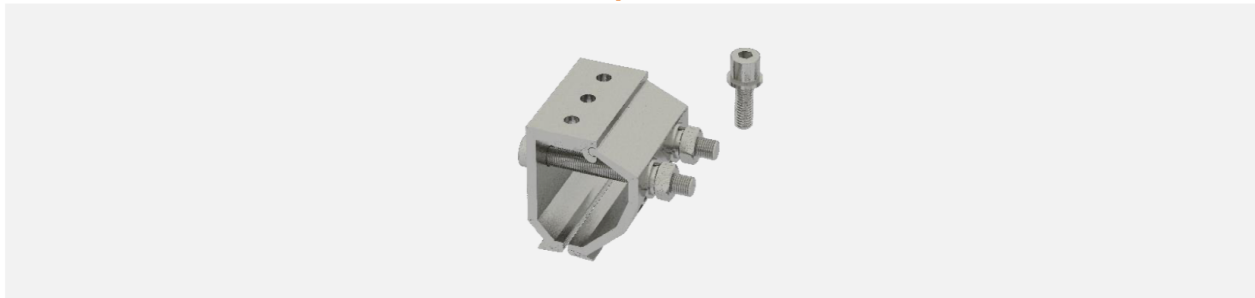
Universal Klip-lok Interface